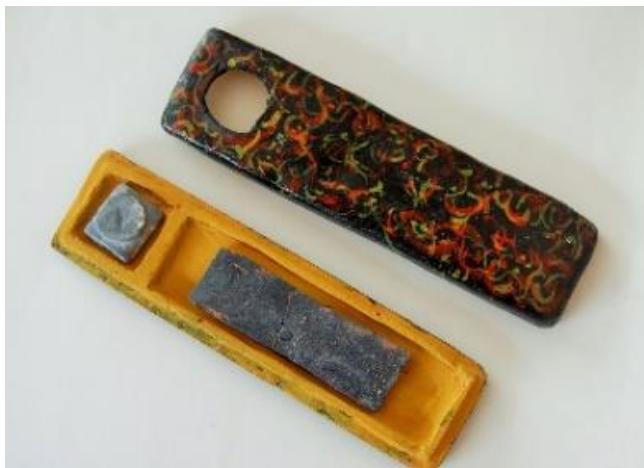
Reconstructed stone palettes