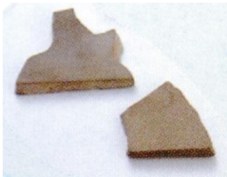
Stone palettes for calligraphy

It is thought to be imported from South China around 2nd centuries B.C.